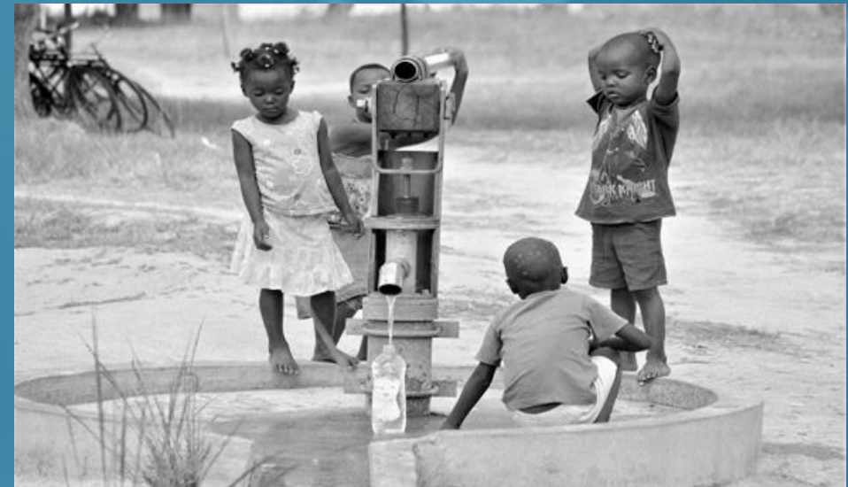
INNOVATE & EMPOWER