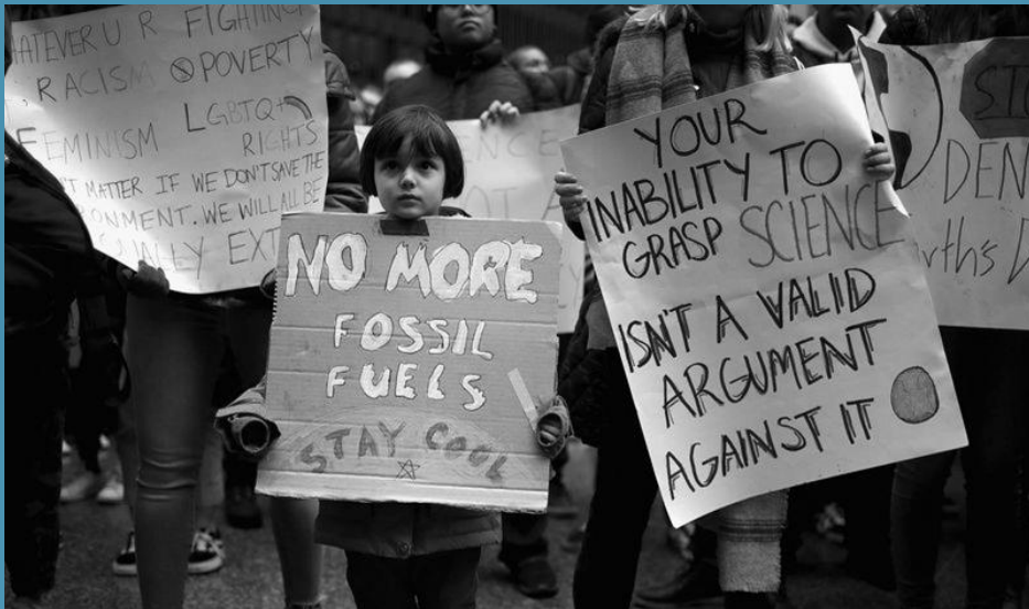
EDUCATE & ENGAGE

We are committed to delivering sustainable healthcare education and engagement initiatives that will accelerate innovation and diversity while empowering the world's untapped minds. Our aim is to consistently drive collaboration in order to find vital solutions that will continue to improve the well being of patients and people everywhere while supporting the revitalization of our planet.